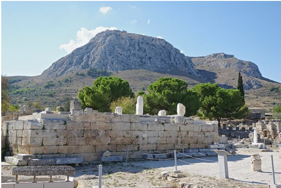
Creative commons CC BY-SA 3.0. Credit: Bertholt Werner

The judicial bench ( bema ) of Corinth with the citadel ( Acrocorinth ) towering above.