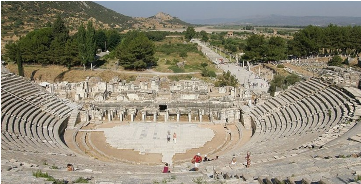
Creative Commons Attribution-Share Alike 2.0.