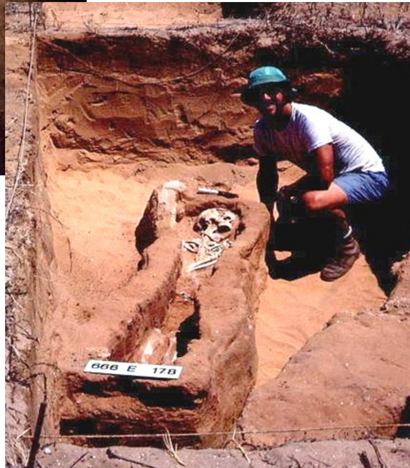
Clay “Coffin” Excavated by the Editor of the EHV