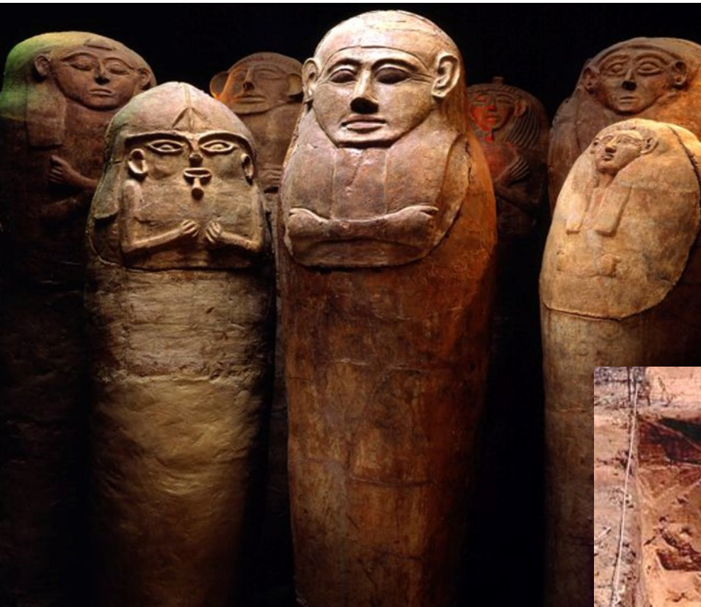
Anthropoid Coffins from the Land of Israel