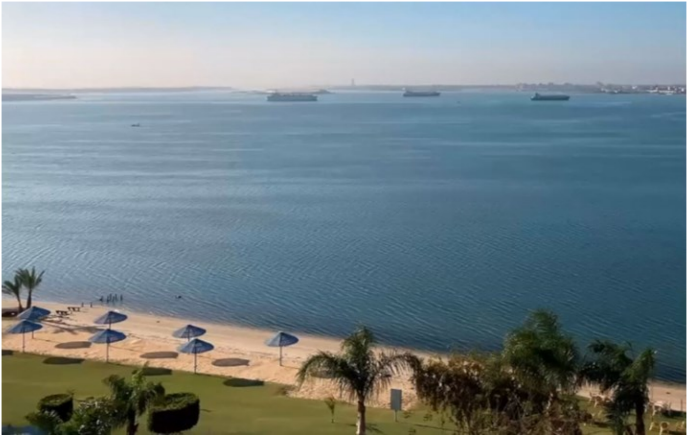
News photo of one of the bodies of water that make up the canal today