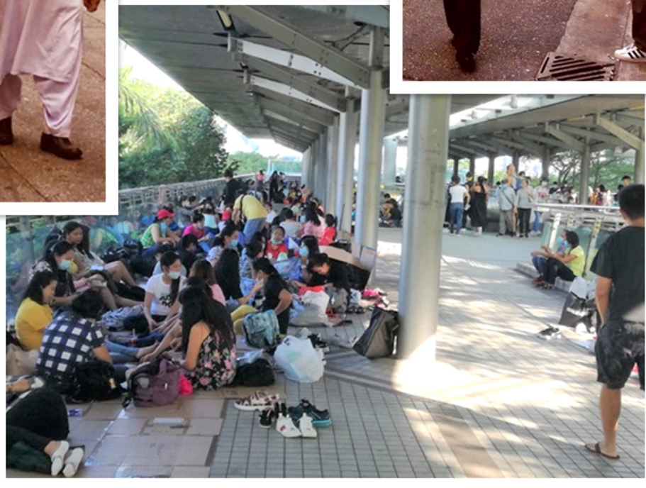
EHV Gospels Being Distributed in Hong Kong