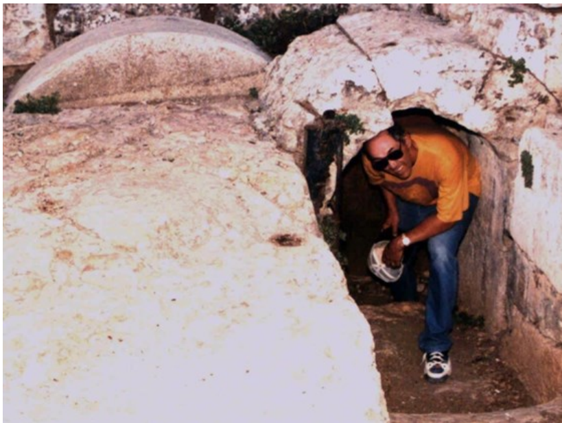
A tomb from the time of Jesus.