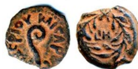
The coin of year 31 ("LIZ")

https://coinsite.com/the-pontius-pilate-coinage