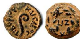
The coin of year 30 ("LIZ")