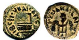
The coin of year 29 ("LIS")